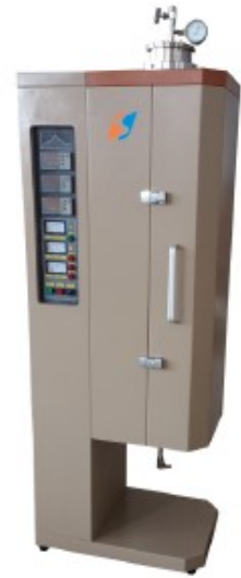
1200 °C Vertical Vacuum Tube Furnace with Three Heating Zone

Supply voltage and wattage also design as per requirement of customer.