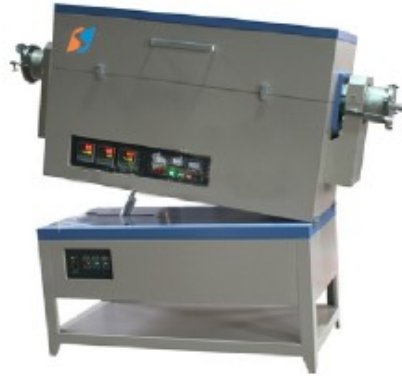
1200 °C Tilting-type Rotary Vacuum Tube Furnace