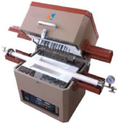
1600 °C Open Top Vacuum Tube Furnace